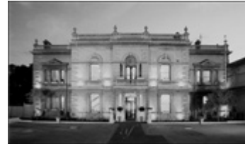
The Alliance Française Melbourne

The exhibition will be held at the Alliance Française gallery, Eildon Mansion, 51 Grey Street, Saint Kilda. It will open on 15 th November for 3 weeks until 6 th December 2007.